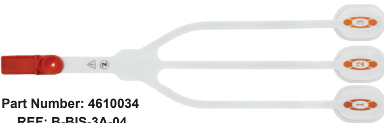
Part Number: 4610034 REF: B-BIS-3A-04

Disposable, single-use EEG sensors are specifically designed for anesthesiologists and medical professionals to monitor and assess the depth of anaesthesia in patients using the Bispectral Index™ (BIS) derived from the EEG signals. This provides real-time information about the patient's consciousness and electrical brain activity during surgical procedures.