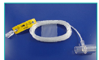
Airway Adapter (Adult), 2.0m Box of 10 Part Number: 4421523