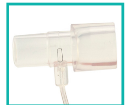
Sampling Line with integral airway adapter