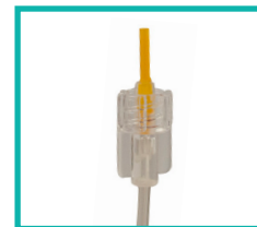
Close-up of LLM line sampling port

H Type sampling lines are available with or without an integral airway adapter. The 'line only' version incorporates a raised (yellow) sampling port and is designed for use with standard airway adapters. The raised sampling port on both versions prevents moisture from flowing down the line, as well as facilitating mid-stream gas sampling.