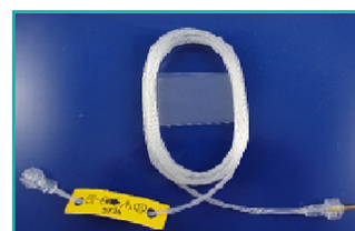
LLM Line only, 2.0m Box of 10 Part Number: 4421513

These sampling lines are available with a range of different connectors: Luer Lock, Respironics (Philips), Masimo (Phase-In). They are also available in multiple configurations of patient type, length and versions. VersaStream sampling lines remove moisture and incorporate bacterial filters, thereby both reducing costs and minimizing risk of cross-infection.