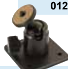
Table Top Swivel Mount*