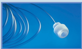
Nasal Sampling Line

Available as Mainstream and Sidestream units; along with a range of VersaStream one-piece sampling lines (sidestream only)