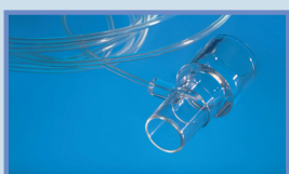
Airway Adapter Sampling Line