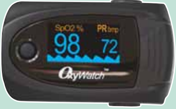
Pleth Waveform 1