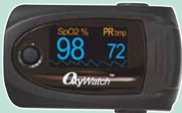
Pleth Waveform 2