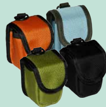
Optional carrying cases with belt loop and D-ring