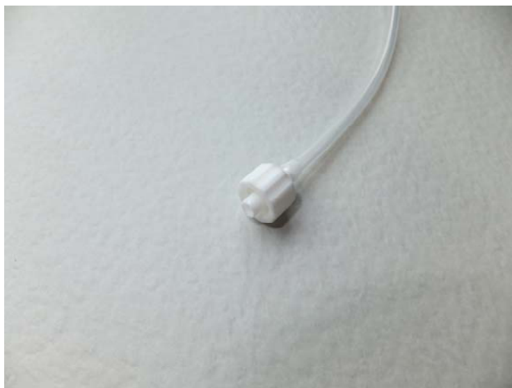
Fig.5 – Luer-Lok™ connector

Ensure that the sampling tubing has a Luer-Lok™ connector attached to each end [Fig.5]. Connect the Luer-Lok™ connector to the pump box [Fig.4].