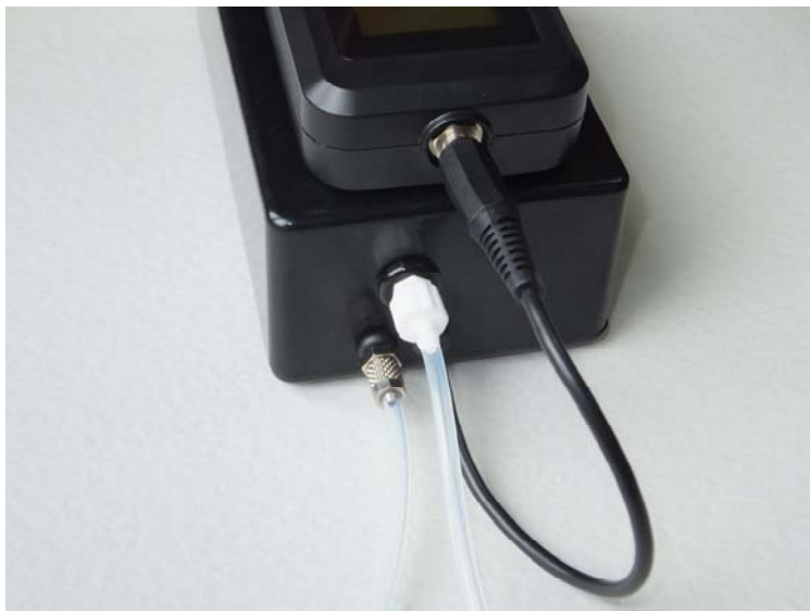
Fig.4 – Connecting the pump box to the analyser

With the analyser mounted on the top of the pump box, connect the 3.5 mm jack plug that exits the pump box into the jack socket on the analyser [Fig.4].