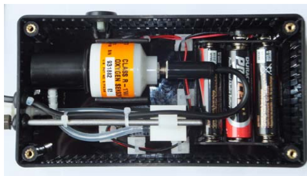
Fig.3 – Battery location in the Gas Analyser Pump Box

Insert 3 x AA / MN1500 / LR6 1.5V alkaline batteries, observing the correct polarity and reconnect the jack plug to the sensor [Fig.3]. Replace the bottom panel.