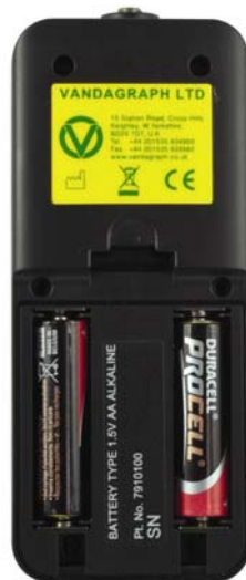
Fig.2 – Battery location in the VN202 mkII Oxygen Analyser

To insert the batteries into the analyser, separate the analyser from the pump box and remove the battery door from the rear of the analyser. Insert 2 x AA / MN1500 / LR6 1.5V alkaline batteries, observing the correct polarity [Fig.2]. Replace the battery door.