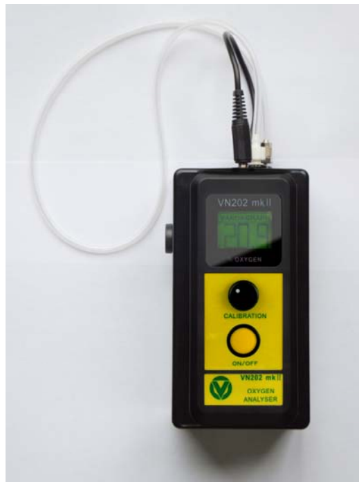
Fig.1 – VN202 mkII Oxygen Analyser with Gas Analyser Pump Box

Sampling tubing is connected to the pump box using a Luer-Lok™ connector. A sampling probe or needle is connected to the sampling tubing.