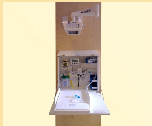
Infant Resuscitation Cabinet system shown mounted on wall strengthening pattern board

Installation of cabinets and warmers is the responsibility of the customer.