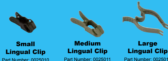
Small Lingual Clip Part Number: 0025010