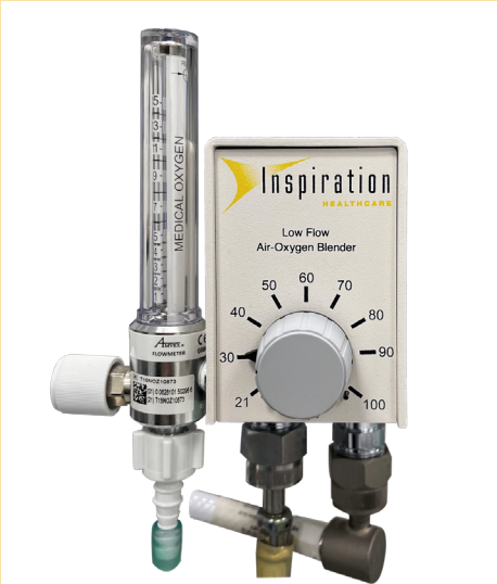
IHC Blender with Flowmeter