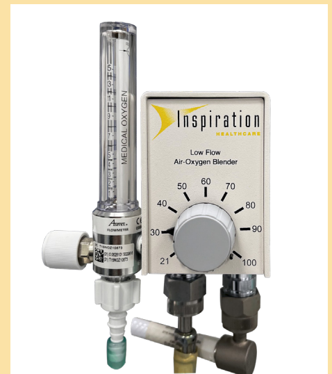
IHC Blender with Flowmeter