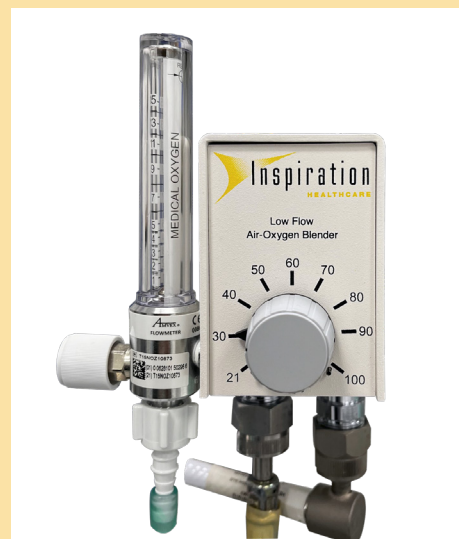
IHC Blender with Flowmeter