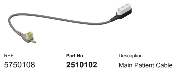
REF 5750108 Part No. 2510102 Description Main Patient Cable