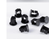
5750102 2510112 Eye Adapters (Box of 50) For use with 2510104 Acceleration (AMG) Transducer