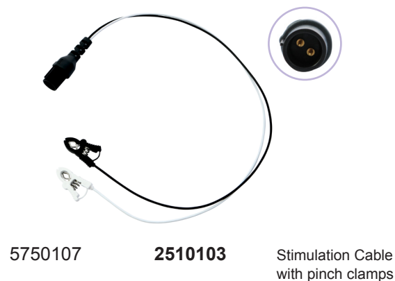
5750107 2510103 Stimulation Cable with pinch clamps