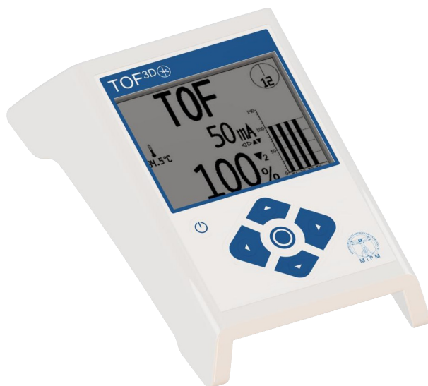
TOF 3D Neuromuscular Transmission Monitor REF: 2510091