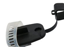
5750100 For use with: and/or 2510110 Hand Adapter 2510104 Acceleration (AMG) Transducer 2510105 Skin Temperature Sensor