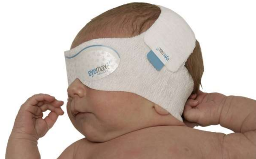
EyeMax Phototherapy Eye Mask

The large eye protection pad has been ergonomically designed to reduce pressure and increase light protection. The headband however allows blue light to penetrate, so that the head continues to receive phototherapy treatment.