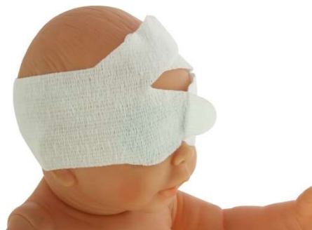
Neomask Phototherapy Eye Mask

The EyeMax is secured at two points on either side of the neonate's head, whereas the NeoMask is adjustable at the top and at the back of the head. These points can be independently adjusted to prevent unwanted movement and allows a comfortable and secure fit.