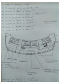
ET18 1st Floor Rep Exhibition as of 27 July 2018.jpg 1497K