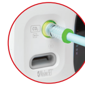
Light Emitting Gas Inlet (LEGI) indicator changes color to indicate the Nomolite sampling line is correctly connected or occluded