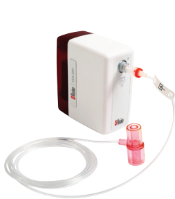
The Nomolite Airway Adapter Set connects to the ISA module

Root capabilities expand with the ISA™ family of modules to include real-time capnography and gas measurements