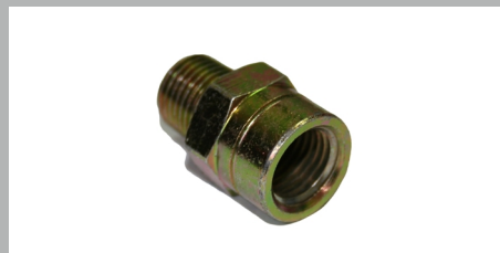
Part Number: 0121250 - tyre chuck adapter