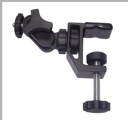
Part Number: 0121200 - universal mounting clamp