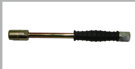
Part Number: 0121252 - 12v tyre chuck