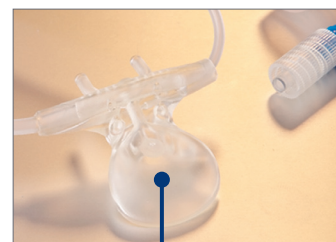
Oral Scoop surface area captures quality samples from mouth breathers