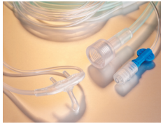
Smart OmniLine Pediatric