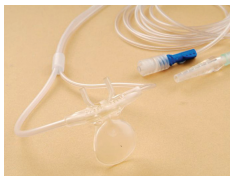
Smart OmniLine Plus