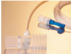
Omni VentLine™ Set