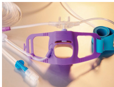
Smart OmniLine Guardian O 2