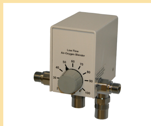
Air/Oxygen Blender (Optional)