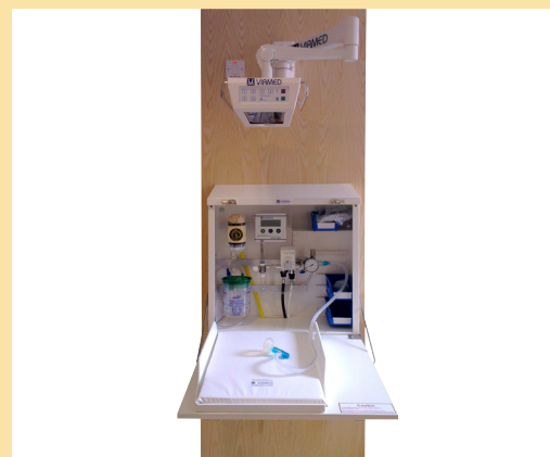
Infant Resuscitation Cabinet system shown mounted on wall strengthening pattress board

Installation of cabinets and warmers is the responsibility of the customer