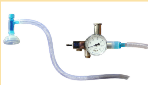
TT480 Infant Resuscitator