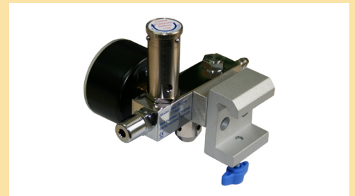
Rear of Tom Thumb with rail clamp