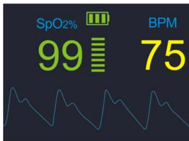
Device in use.

Once the finger oximeter is switched on and the patient's finger is inserted correctly, monitoring will begin automatically.