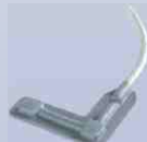
Silicone Wrap Sensor