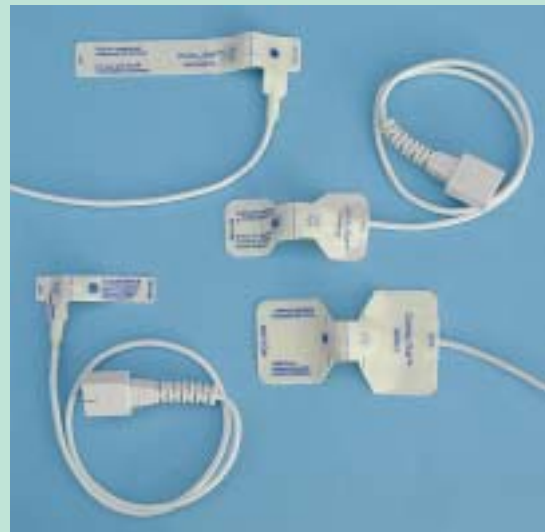
Single Patient Use Sensors