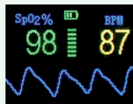
Pleth waveform display