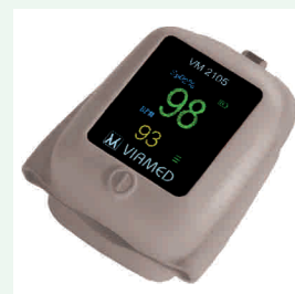
VM-2105 - Grey