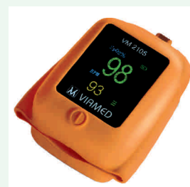
VM-2105 - Orange