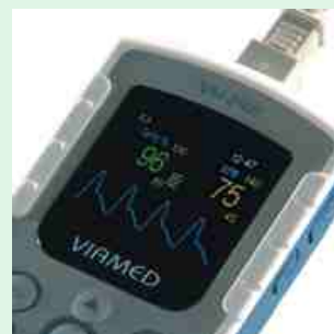
VM-2160 OLED Display

NB. The Universal Mounting Kit is required when using any of the above mounting options.