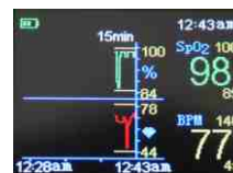
Short Term Trending Display