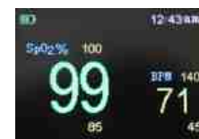
Large Digit Display