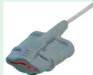
Silicone Finger Sensor for use with VM-2160