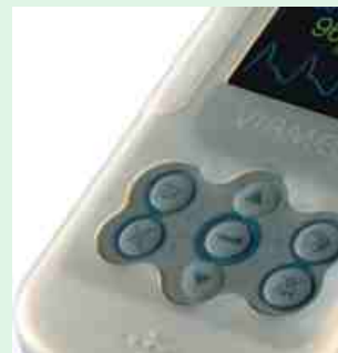
VM-2160 in Protective Cover