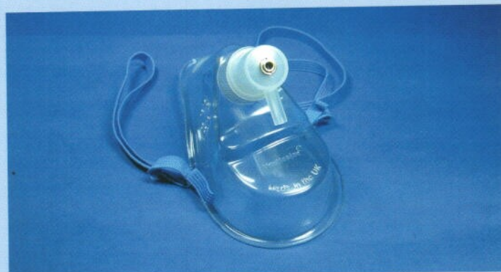
Mask with integrated PEP sensor.