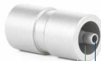
22 mm Large Bore