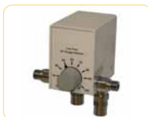
Air/Oxygen Blender (Optional)