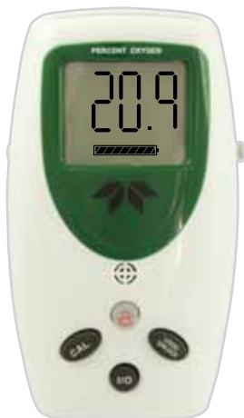
AX300 50% of Actual Size 3.5 digit display