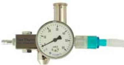
TT480 Infant Resuscitator