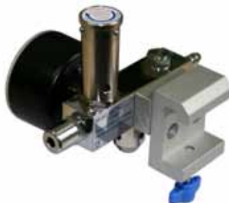
Rear of Tom Thumb with rail clamp