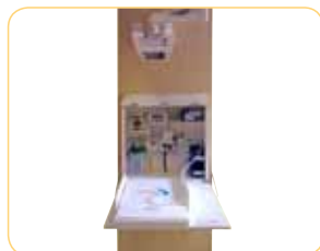
Infant Resuscitation Cabinet system shown mounted on wall strengthening pattress board

Installation of cabinets and warmers is the responsibility of the customer