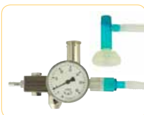
TT480 Tom Thumb with NeoPEEP resuscitation circuit and mask