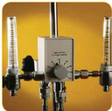
High flow blender on pole mount