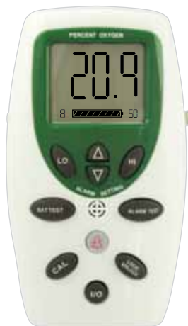
MX300 50% of Actual Size 3.5 digit display

Featuring easy calibration and settings which are secured automatically. In addition, the low power requirement allows the units to operate continuously for 2000 hours on just 3 x AA alkaline batteries. Both models also feature the R-17MED oxygen sensor, providing superior long-term stability and accuracy.