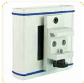
0320201, Medirail mounting bracket