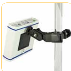
0121200, Universal mounting clamp