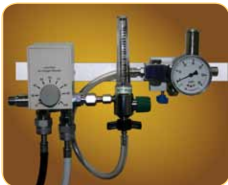
Low flow blender on rail mount, supplying a Tom Thumb TT480 infant resuscitator. Tom Thumb shown is model TT480 without flowmeter, other models of Tom Thumb require modification for use with blenders.