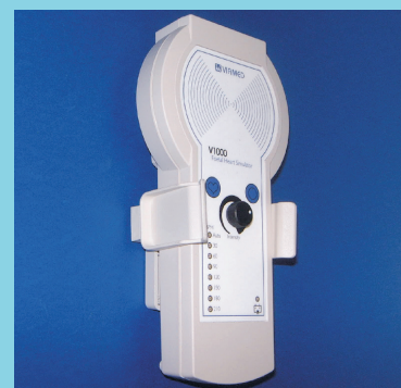
V1000 on wall mounting bracket