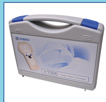
V1000 Hard Plastic Case