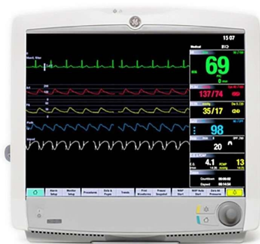
GE Carescape Patient Monitor with Entropy Monitoring

Entropy monitoring responds faster to changes than BIS. The choice between BIS and Entropy monitoring may depend on the specific requirements of the clinical setting and the available anaesthesia equipment.