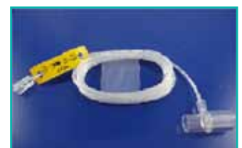
Airway Adapter (Adult), 2.0m Box of 10 Part Number: 4421523