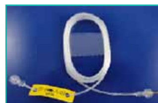
LLM Line only, 2.0m Box of 10 Part Number: 4421513

These sampling lines are available with a range of different connectors: Luer Lock, Respironics (Philips), Masimo (Phase-In). They are also available in multiple configurations of patient type, length and versions. VersaStream sampling lines remove moisture and incorporate bacterial filters, thereby both reducing costs and minimizing risk of cross-infection.