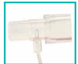
Sampling Line with integral airway adapter