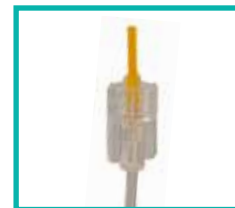
Close-up of LLM line sampling port

H Type sampling lines are available with or without an integral airway adapter. The 'line only' version incorporates a raised (yellow) sampling port and is designed for use with standard airway adapters. The raised sampling port on both versions prevents moisture from flowing down the line, as well as facilitating mid-stream gas sampling.