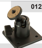
Table Top Swivel Mount*