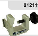
'V' Mount Pole Clamp Horizontal 10 - 40 mm clamping width