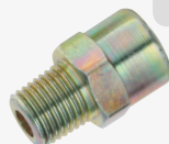
8v1 Twin Hold-On Connector for 8 mm valves (commonly used for automotive tyres)