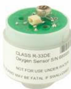
R-33DE for use with O2 EII