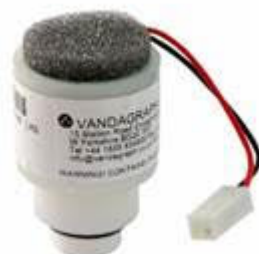
R-22AT for use with ATA & ATA Professional