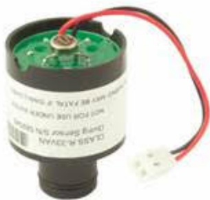
R-33VAN for use with Mini O2 DII