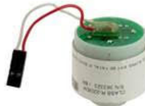
R-22DEM for use with O2 EII (old style)