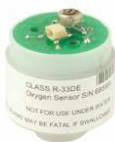
R-33DE for use with O2 EII