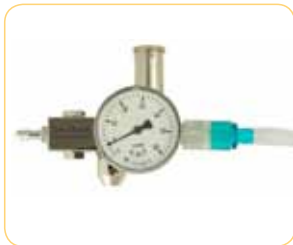
Configuration 1: TT480

3210011 NeoPEEP neonatal resuscitation circuit (single patient use) 0120140 Adapter: 15 mm I.D. - 15 mm I.D. Reusable; for connecting the NeoPEEP to the Tom Thumb 0120151 Adapter: 15 mm I.D./22 mm O.D. - 15 mm I.D./22 mm O.D. Pack of 20 Disposable; for connecting the NeoPEEP to the Tom Thumb 3210070 Single use silicone round facemask - size 0 40 mm (Height) x 27.4 mm (Inner Width) x 48.6 mm (Diameter) - Connector Diameter 15 mm O.D