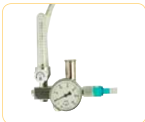
Configuration 2: TT490-15 with 1 m Oxygen hose