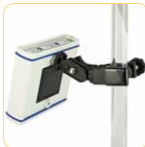
0121200, Universal mounting clamp