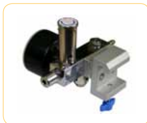
Rear of Tom Thumb with rail clamp