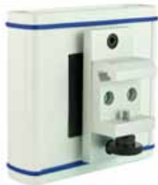
0320201, Medirail mounting bracket