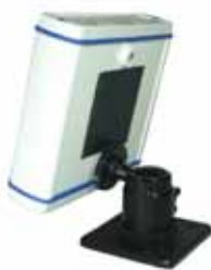
0121199, Swivel mount