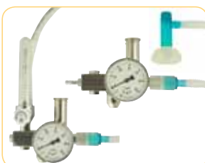
TT490 and TT480 Tom Thumb with NeoPEEP resuscitation circuit and mask