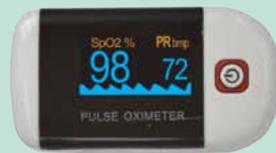
Pleth Waveform 1