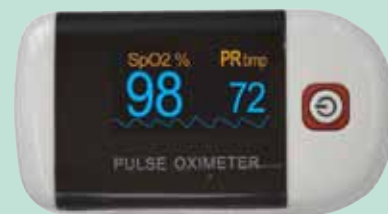
Pleth Waveform 2