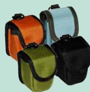
Optional carrying cases with belt loop and D-ring