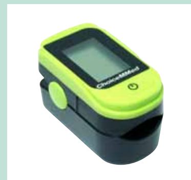
Green and Black