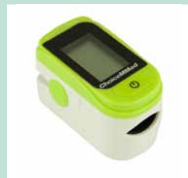
Green and White