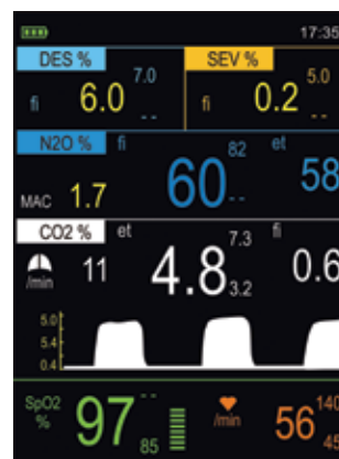
Standard 2 Anaesthetic Agents