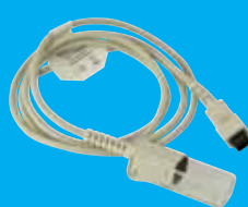
Extension Cables 1.2m Part Number: 0014895 2.4m Part Number: 0014896