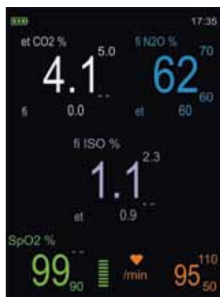
Numerical 1 Anaesthetic Agent