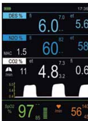
Standard 1 Anaesthetic Agent