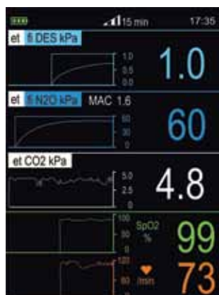
Multi Trend - 15 minutes