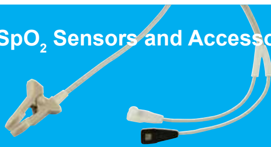
Lingual Sensor Part Number: 0015000