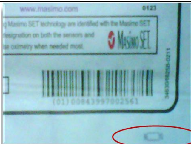
LNCS / M-LNCS Pouch