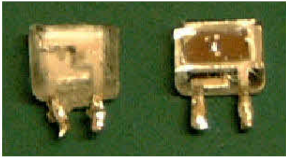
'OEM' (Lead Frame)