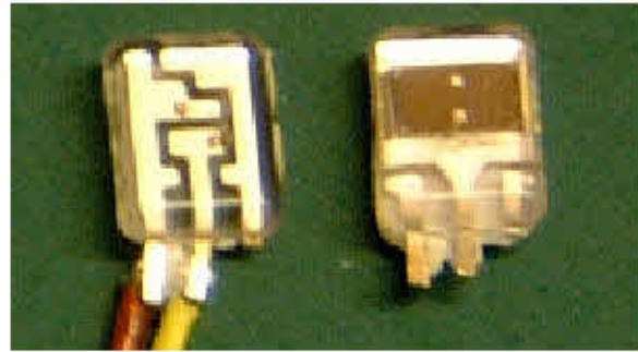
'Viamed' (Lead Frame)