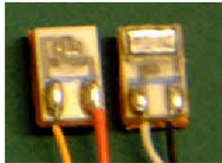
'Generic' manufacturer 'B' (Ceramic)